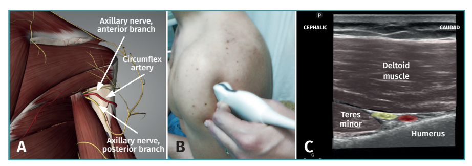
Figure 3. A: anatomy of the axillary nerve; B: view of ultrasound probe placement for locating the axillary nerve; C: ultrasound view of the axillary nerve and arteries.